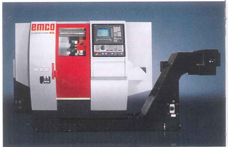
Emco Maier Corp., call 614-771-5991, or search productionmachining.com/suppliers

The machine offers dynamic digital drives, a thermo-symmetrical machine construction, compact dimensions and several automation options.