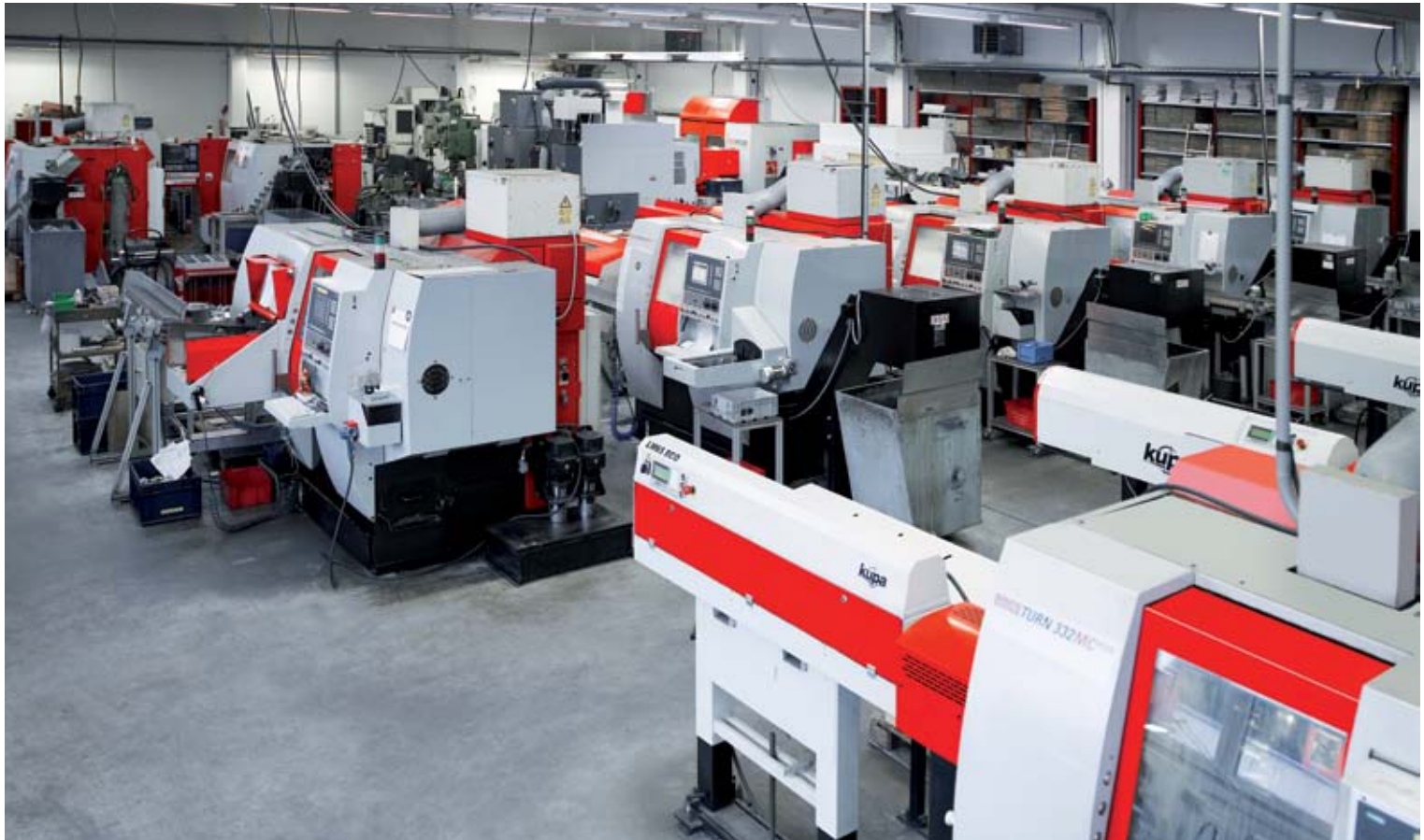
Machine pool at Brisker comprising numerous EMCOTURN 332, HYPERTURN 665 and HYPERTURN 45.