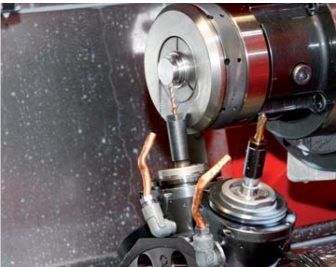
Finishing on the counter spindle

system, Siemens 840D-sl (solution line), makes the machine quick and easy to program. When coupled with the CAM solution Esprit from DP Technology, the HYPERTURN 45 becomes a high-tech production center with 3D simulation.