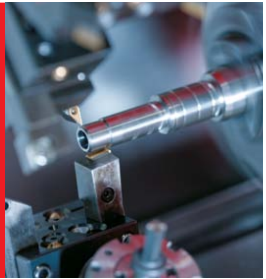
Simultaneous turning work is possible using both turrets on the main or counter spindle.

Range of parts: As an industrial supplier to all sectors, Brisker GmbH manufactures turned and milled parts in series from 50 to 5,000 pieces from all standard materials