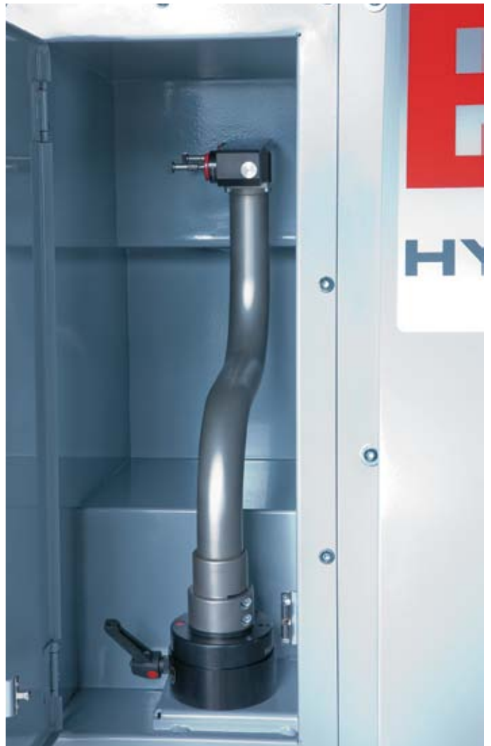
Storage location for the removable tool measuring arm

„We don't just blindly buy EMCO out of habit - we also use CNC machines from other manufacturers. However, for this range of parts in particular, there is simply no comparable two-spindle machine on the market that offers such a high level of precision from such a small footprint,“ says Johann Brisker, who is clearly impressed with the HYPERTURN 45. The fact that this Viennese company received the world's first HYPERTURN 45 should also not go unmentioned.