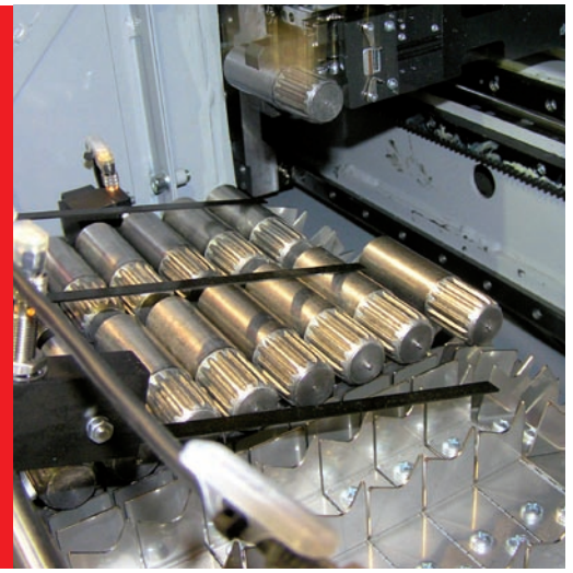
The finished driveshafts made of stainless steel connect the electronics with the mechanics in the pumps.