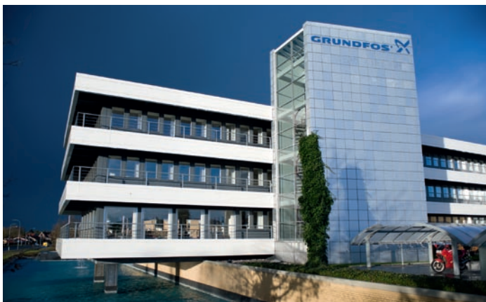
Impressive: the Grundfos headquarters at Bjerringbro/Denmark.

EMCO started producing conventional lathes in 1947. In the years that followed, the company became Austria's largest manufacturer of machine tools for turning and milling work. Today, the EMCO Group has production sites in Austria, Germany, Italy and the Czech Republic, its own sales branches in Germany, Italy, France, Spain, the USA and the Czech Republic, and is part of the listed industrial group A-TEC Industries AG. The EMCO Group has over 800 highly-qualified employees worldwide and generated a 2008 turnover of EUR 187.1 million. With over 160 sales and service branches, EMCO is represented in all the major international markets. Its comprehensive product range includes training machines, conventional and cycle controlled lathes and milling machines, and CNC turning and milling centers for complete machining. The large range of automation components can be used to upgrade the machines into fully automated manufacturing cells. EMCO has made a name for itself on a global level with its second company division 'EMCO Industrial Training', which offers a modular training concept for metalworking with machine tools.