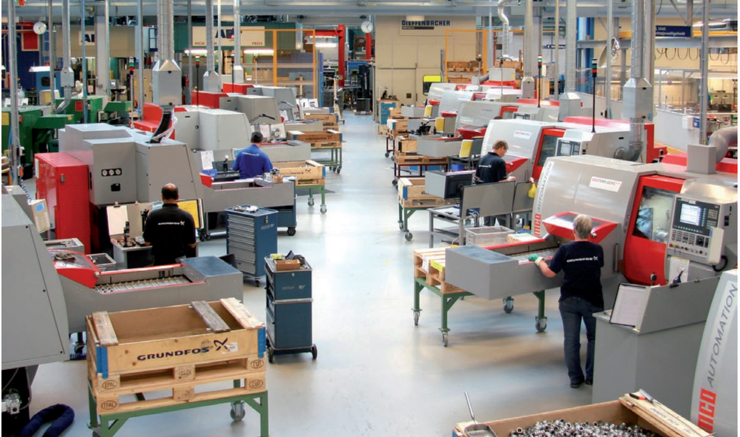
The EMCO machinery at Grundfos in Denmark. Other plants beside the headquarters order from EMCO, too.