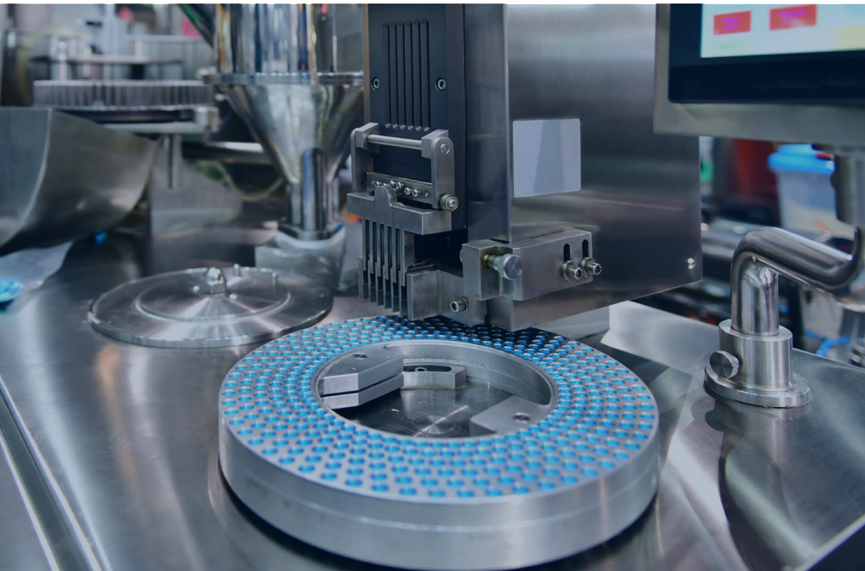
PUNCH OF A TABLET PRESS