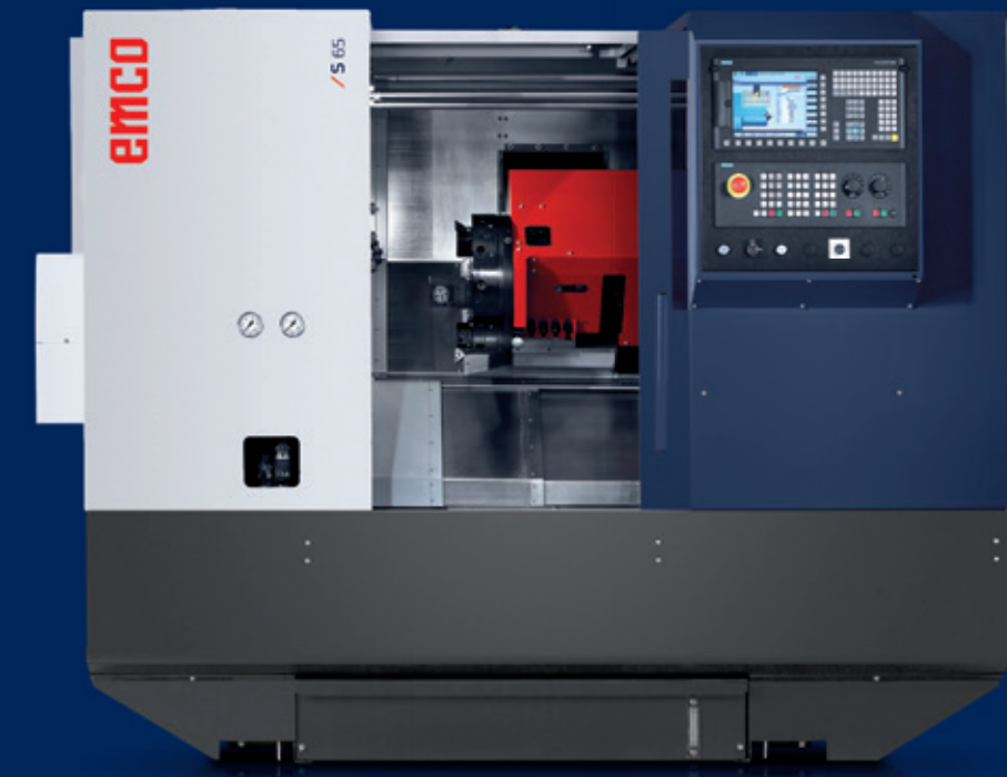
Machine with optional equipment

The compact CNC lathe with turn-mill turret is predestined for processing bar parts with a diameter of up to 65 mm and chuck parts of up to 310 mm. The main spindle features speeds of up to 4200 rpm and a main drive power of 18 kW. For shaft machining the machine is also available with an automatic tailstock. With an optimal accessibility the machine offers best conditions for the production of small lot sizes.