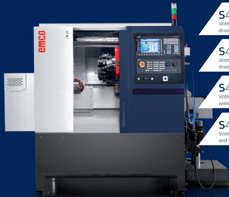
Machine with optional equipment

The compact CNC lathe with turn-mill turret is predestined for processing bar parts with a diameter of up to 45 mm and chuck parts of up to 220 mm. The main spindle features speeds of up to 6300 rpm and a main drive power of 11 kW. For shaft machining the machine is also available with an automatic tailstock. With an optimal accessibility the machine offers best conditions for the production of small lot sizes.