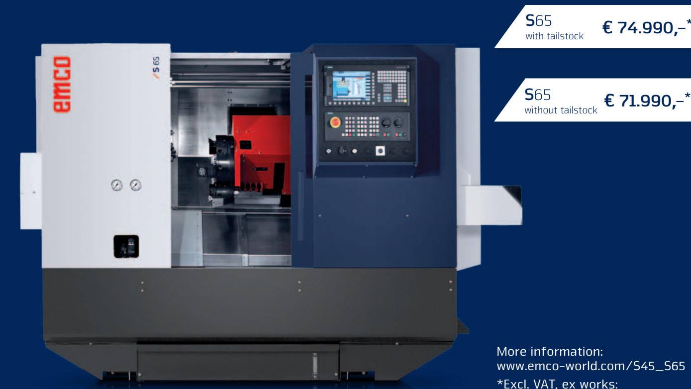
Machine with optional equipment

The compact CNC lathe with turn-mill turret is predestined for processing bar parts with a diameter of up to 65 mm and chuck parts of up to 310 mm. The main spindle features speeds of up to 4200 rpm and a main drive power of 18 kW. For shaft machining the machine is also available with an automatic tailstock. With an optimal accessibility the machine offers best conditions for the production of small lot sizes.