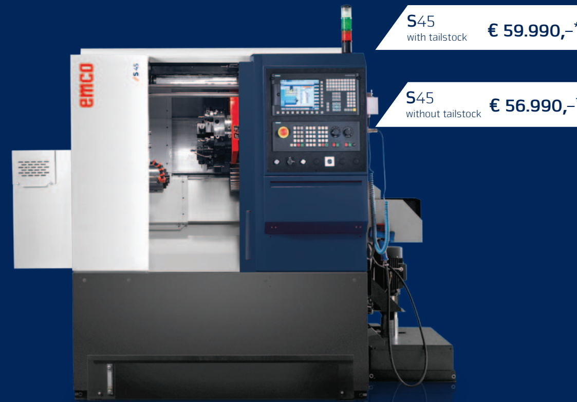
Machine with optional equipment

The compact CNC lathe with turn-mill turret is predestined for processing bar parts with a diameter of up to 45 mm and chuck parts of up to 220 mm. The main spindle features speeds of up to 6300 rpm and a main drive power of 11 kW. For shaft machining the machine is also available with an automatic tailstock. With an optimal accessibility the machine offers best conditions for the production of small lot sizes.