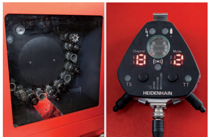
The 20-pocket tool magazine and the Heidenhain touch probe for workpiece and tool measurement supplement the machine equipment to ensure work-related training.

'As an option, the machine can be equipped with high-efficiency torque drives. This allows for an easy upgrade to simultaneous 5-axis machining. The tool magazine offers space for 20 tools with ISO 30 adapter, whilst tool changing takes no more than 2 seconds. Thanks to a maximum expansion level, it is possible to include a magazine with up to 50 tool pockets. As an option, you can also choose a motor-driven spindle with 24,000 rpm instead of the common mechanical spindle with 12,000 rpm,' explains Pichler the features of the machine. 'We deliberately did not select the maximum options. Whilst this is not necessary for training, we wanted to provide a good average when it comes to performance, because that is what the new