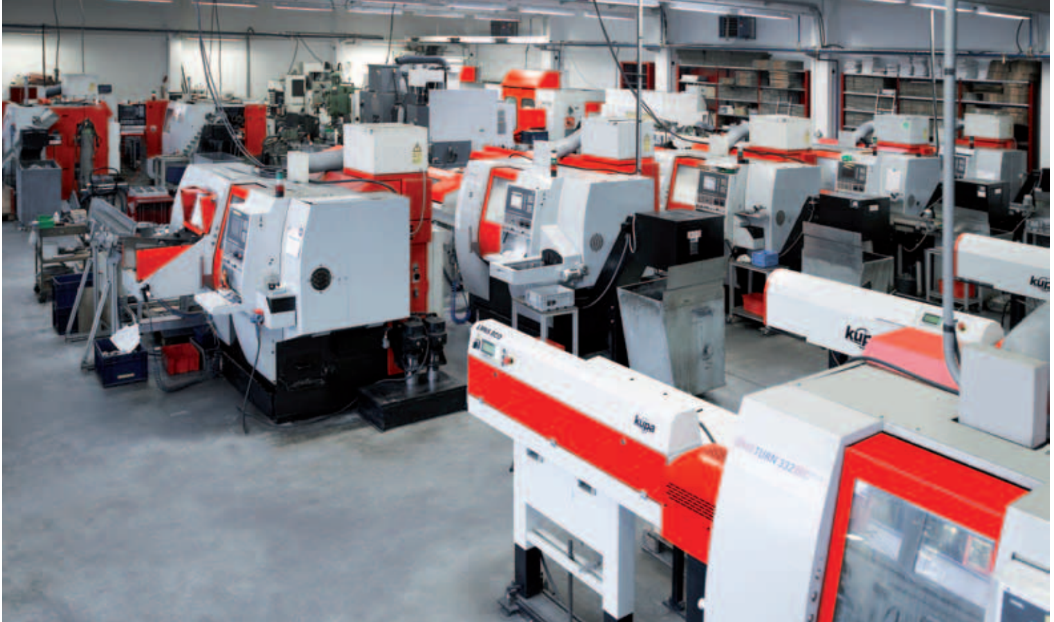
Machine pool at Brisker comprising numerous EMCOTURN 332, HYPERTURN 665 and HYPERTURN 45.