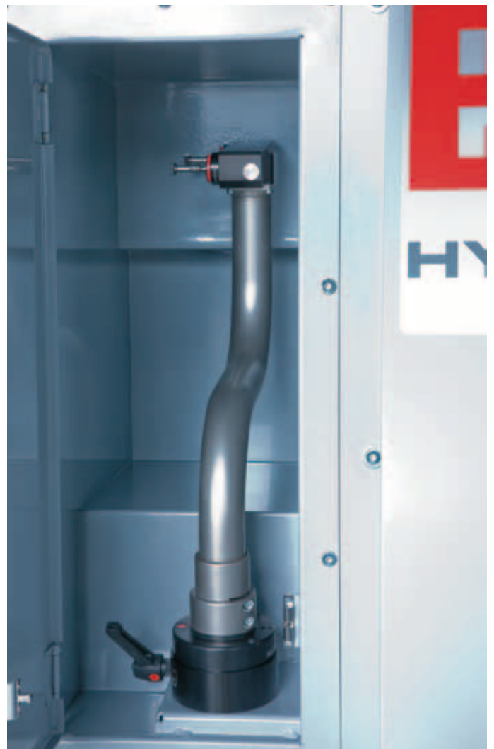
Storage location for the removable tool measuring arm

„We don't just blindly buy EMCO out of habit - we also use CNC machines from other manufacturers. However, for this range of parts in particular, there is simply no comparable two-spindle machine on the market that offers such a high level of precision from such a small footprint,“ says Johann Brisker, who is clearly impressed with the HYPERTURN 45. The fact that this Viennese company received the world's first HYPERTURN 45 should also not go unmentioned.