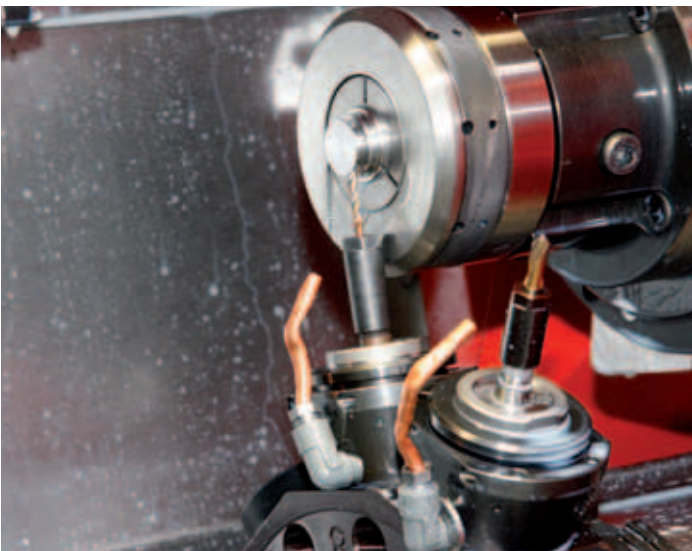
Finishing on the counter spindle

system, Siemens 840D-sl (solution line), makes the machine quick and easy to program. When coupled with the CAM solution Esprit from DP Technology, the HYPERTURN 45 becomes a high-tech production center with 3D simulation.