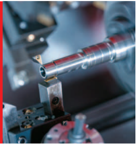
Simultaneous turning work is possible using both turrets on the main or counter spindle.

Range of parts: As an industrial supplier to all sectors, Brisker GmbH manufactures turned and milled parts in series from 50 to 5,000 pieces from all standard materials