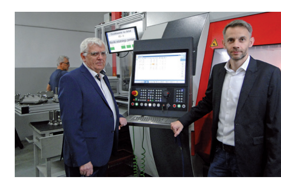
Owner and project manager of PROPART in front of the EMCOTURN E65

For PROPART, the main reasons for carrying out the project with EMCO were the individual technological solution offered by EMCO, EMCO's solution-oriented approach to the requirements, flexibility, direct access to EMCO designers and the transparent, mutual exchange of information and experience between the two companies. From the very beginning, EMCO has shown great interest and commitment to professional cooperation. Furthermore, the economic benefit for PROPART was an important factor. By implementing the workpiece measuring device, production costs in the company could be reduced and quality could be optimized (reduction of production defects by enabling the automatic dimension correction of the measuring device). The increased precision in the production of gear parts improves the quality of the parts and thus increases the competitiveness of PROPART. The automation of the machines solves the problem of the prevailing lack of skilled workers at least in certain areas and helps to reduce the personnel costs.