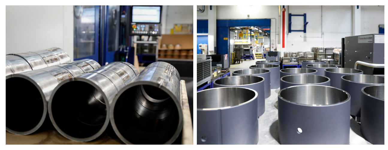
The plain bearing bushes are made of a composite material and are used in applications with diameters from 125 to 500 mm.